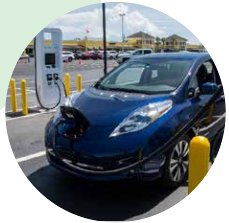
Electrify America DC Fast Charger Network Deployment