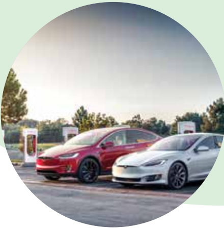
Tesla Supercharger Network Deployment

A leader in the clean transportation market, Black & Veatch has completed design, engineering, permitting, and construction for over 1,500 electric vehicle charging sites, totaling thousands of chargers, and the first U.S. open-to-the-public high-powered charging station for heavy-duty vehicles. Black & Veatch brings the knowledge, experience, and end-to-end solutions to plan and deploy cost-efficient, sustainable, and resilient energy and transportation systems.