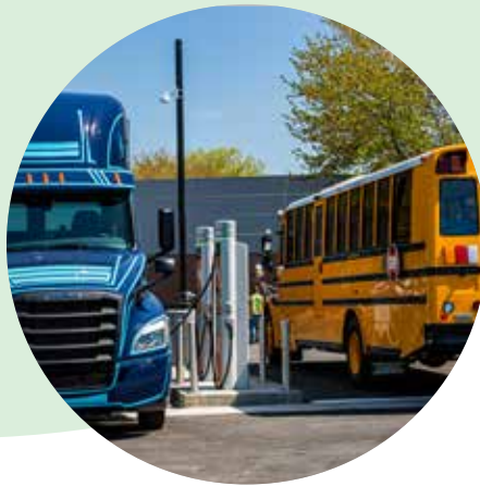
Electric Island deployment, Daimler Trucks North America and Portland General Electric