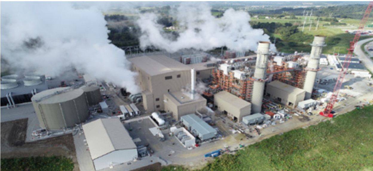
Westmoreland Generating Station, Smithton, Pennsylvania

As a world leader, our clients depend on us to creatively apply advanced technology to all types of power generation applications. We work with the OEMs to integrate the newest technology breakthroughs, such as increased use of hydrogen, LPG, and RNG fuels to meet long term sustainability goals.